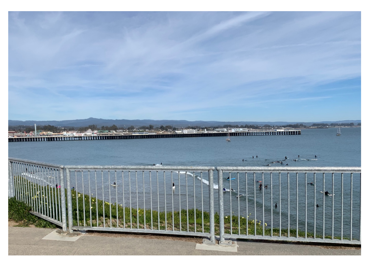
It was no surprise to find a very large, very busy marina.