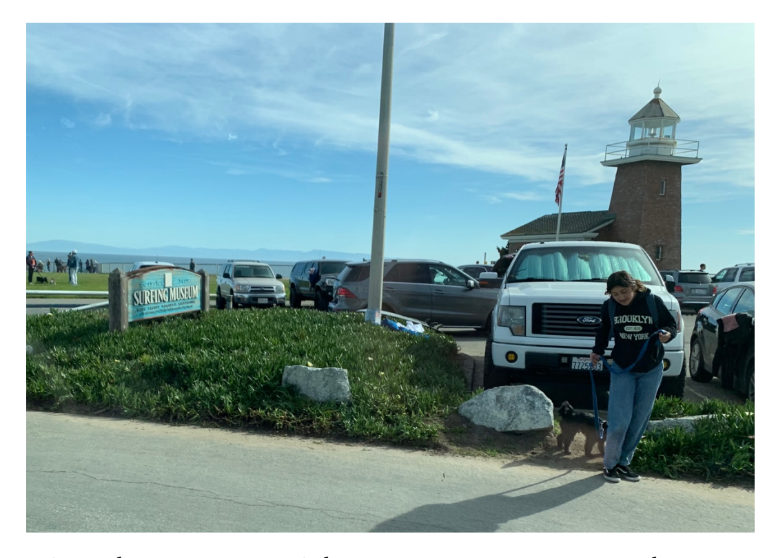
That weekend, they were apparently having a surfing competition, so they were everywhere!

Apparently, you know you're in Santa Cruz when ... there are so many surfers, there's a Surfing Museum!