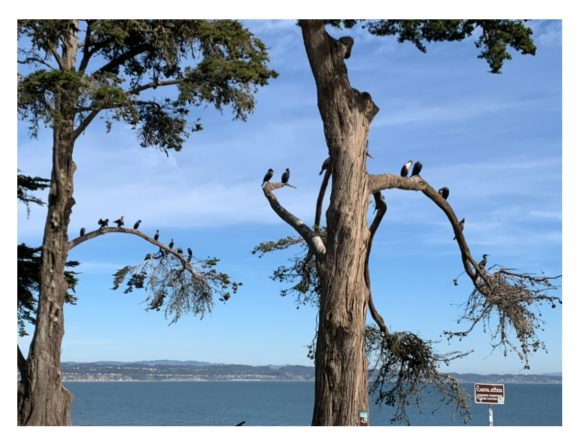
And then Capitola Village...