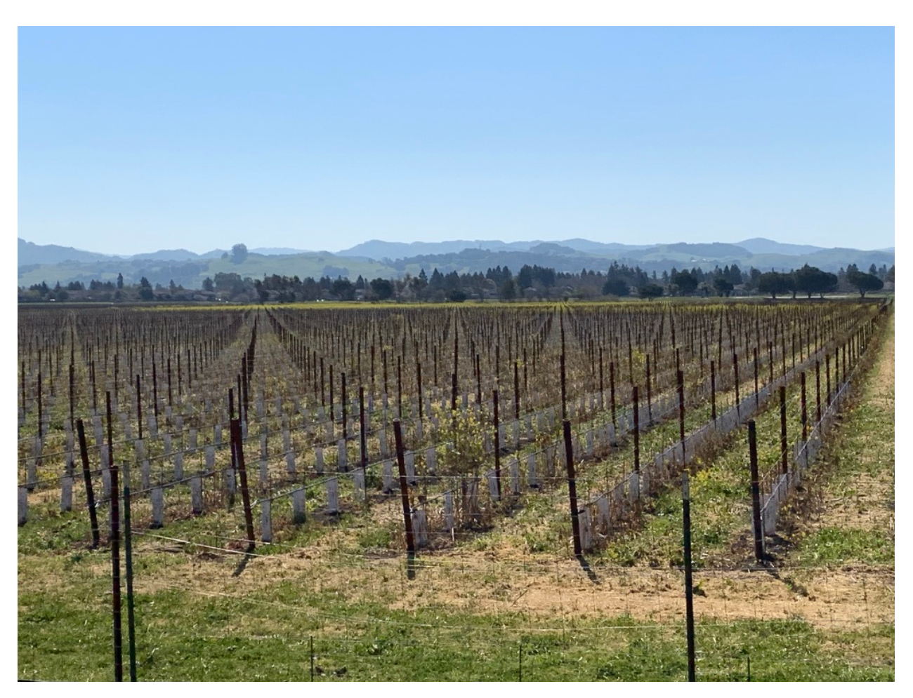
Trip 2 – Episode #41 – Wine Country!

Most of you who have been following our travels have noted that we seem to raise a glass on a somewhat regular basis.