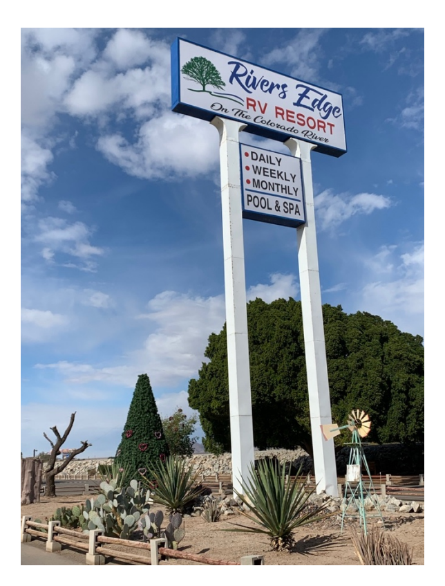
The RV resort was, as advertised, right on the Colorado River.

Because so many people go back and forth across the border between Arizona and California every day, they don't acknowledge the time change. So even though we were officially on California Time we were still on Arizona time.